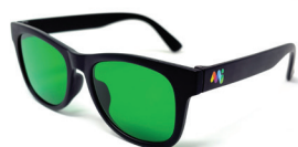
MiOptics Sport and Sport Plus