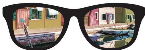
Other lenses on the market are not true nbGL.

Seeing only a TRUE NARROW BAND of GREEN LIGHT can soothe symptoms, helping you to return to normal functioning and improved quality of life.