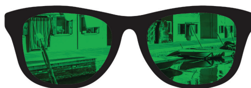
MiOptics lens technology is true nbGL.